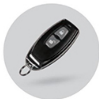
Smart Wireless Key