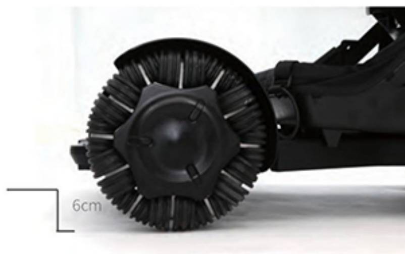
The unique Omni-wheels of iMOVING A1 chair, let you choose your own path from curbs, to cobblestones, to grass. Allow you to go courageously. Parks, beaches, and yards, anywhere.