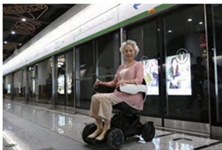
The under-seat shopping basket stores up to 6 pounds.