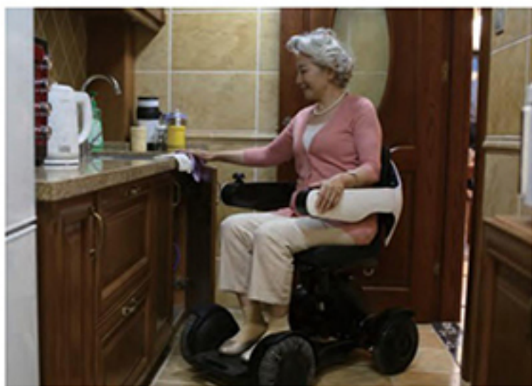
iMOVING A1 takes up less space than other outdoor wheelchairs.

iMOVING A1 has a tight turning radius to maneuver around in tight places with the help of its unique Omni-wheels.