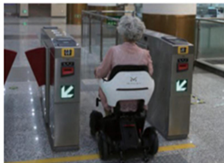
76 cm turning radius. .